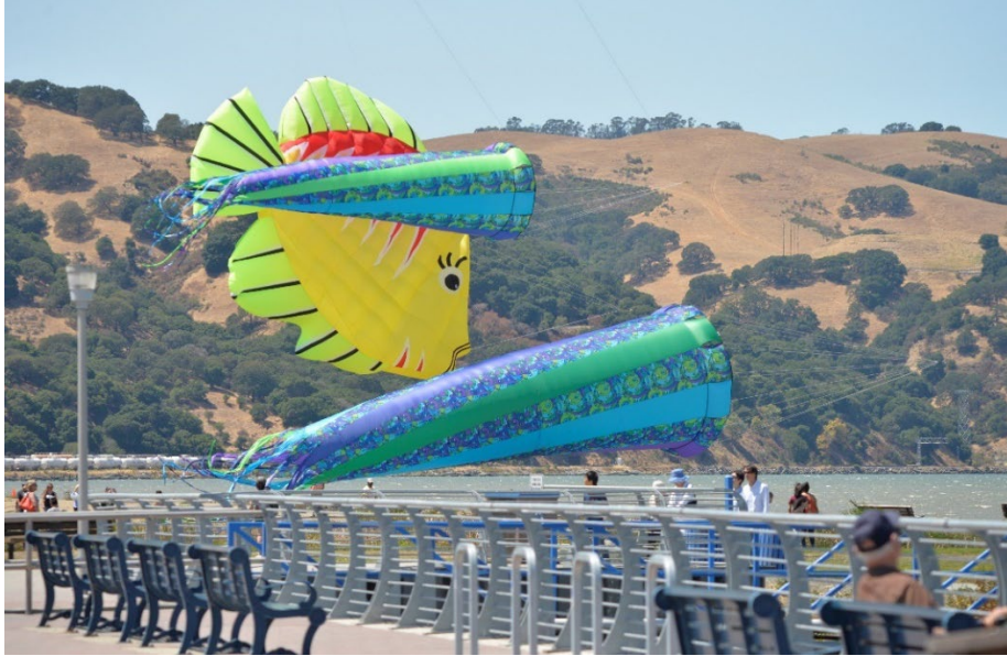
Kites at Radke Martinez Regional Shoreline