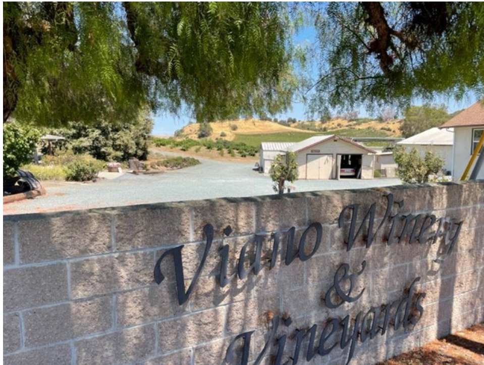
Viano Winery & Vineyards on Morello Avenue

Pine Meadows Golf Course Parcel: Areas in Martinez designated as open space include an approximately 25-acre parcel at the corner of Vine Hill Way and Center Avenue that was formerly the Pine Meadows Golf Course. The golf course ceased operations and the parcel was sold for residential development. This required a rezoning of the property from open space and recreation to low density residential use. Litigation ensued after City Council approval of the rezoning. The settlement agreement designates approximately 9.5 acres as open space and recreation use, and the remaining approximately 15.5 acres as low density residential. The largest portion of the open space of 8.22 acres will become a neighborhood park and has been added to the list of parks in the Parks & Community Facilities Element. The park's addition will create greater public access and use for a portion of the area that was previously restricted to golfers. The reduction in open space for the remaining area rezoned to residential is offset by the potential creation of approximately 60 homes that will be added to the housing supply to meet a portion of the City's state mandated housing production goals. The land use map (Figure 2-4) in the Land Use Element reflects the reduction of open space for this parcel.