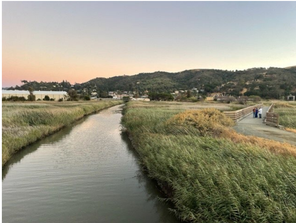
View from Radke Martinez Regional Shoreline