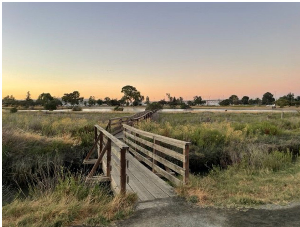
View from Radke Martinez Regional Shoreline

In addition to habitat and scenic value, open space in Martinez serves agricultural purposes, and provides for public health and safety by supplementing City flood control efforts, reducing the urban heat island effect, removing toxins from our air and water, and more. For these and other reasons it is important for the policies in this Element to guide development in a manner that protects lives and property while preserving the benefits open space provides.