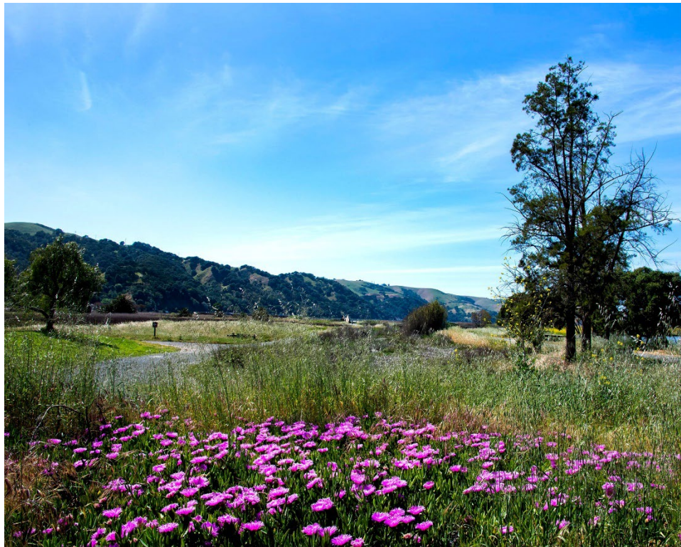
Radke Martinez Shoreline

Policy OSC-P-4.3: Development in sensitive habitat areas should be avoided or mitigated to the maximum extent possible.