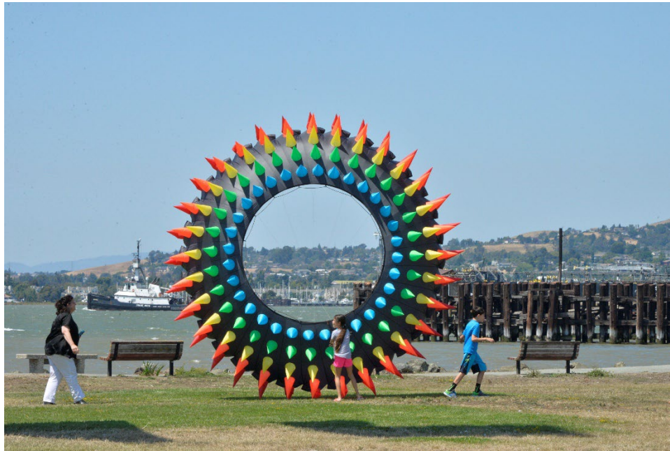
Kite at Radke Martinez Shoreline

Conservation does not preclude growth; rather, it calls for more efficient use of resources and an understanding of the interrelatedness of natural and manmade systems. Typically, conservation is thought of as preserving natural lands, but it also includes other important concerns such as water, energy, and resource use. While there are numerous ways to address these issues, one of the easiest ways to begin is by addressing tangible local conservation concerns. In the case of Martinez, this means preserving open space, our primary natural resource, given its significant role in bolstering the City’s identity and vitality. In addition to open space, this Element also addresses the following topics as they relate to local circumstances: agriculture and mineral resources; biological resources; watersheds; water quality; air quality; and energy and resource use.