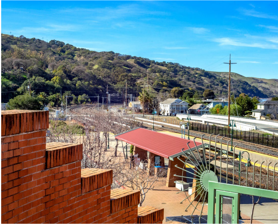
View of Franklin Hills

Downtown Neighborhoods: This area surrounding the Downtown Core is defined by the presence of existing older service commercial/industrial and eclectic uses. It is an area in transition and, as such requires balancing retention of current uses, while encouraging the ultimate replacement of such uses with a variety of more intense uses which can better define a traditional mixed-use urban environment and encourage the introduction of more residential uses as outlined in the 2006 Downtown Specific Plan .