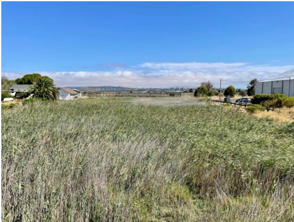
View east of former Granger's Wharf

Natural topography is often preferred as open space and can be property owned by the City or other public agencies (i.e., East Bay Regional Park District, National Park Service, etc.) for the purpose of public recreation and/or preservation of scenic and natural resources, or it may be private lands with land use regulations or easements restricting use to open space. Examples of unique natural areas include the waterfront; City/East Bay Regional Park District lands at Franklin Hills and Shoreline; wetland areas; Mt. Wanda; Schaefer Memorial Open Space; and Hidden Lakes and Roanoke (Virginia Hills) open space areas. These defining natural topographic features may include private lands that have either extreme constraints to development, such as steep slopes or scenic resources to preserve.