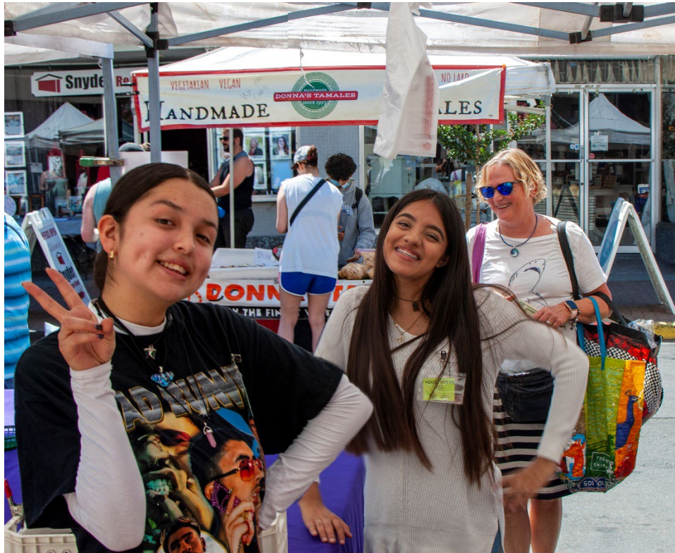
Martinez Youth Volunteers

As a mature community, it is critical that Martinez think strategically about how and where reinvestment should occur and where it is appropriate for limited new development to take place. The overarching goal is to conserve those parts of the City that have value the way they are and to direct redevelopment to areas where land may currently be underutilized.