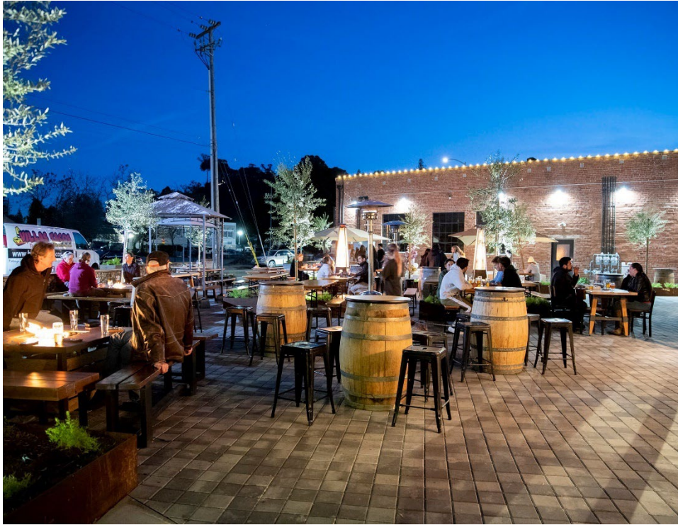
Downtown Martinez Nightlife