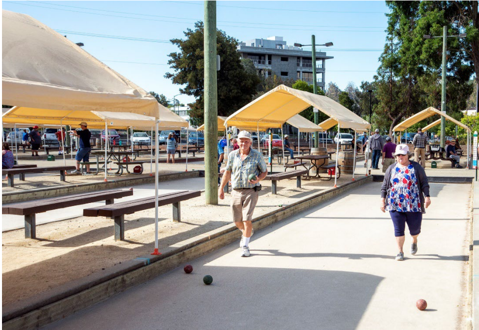
Ken Bothée Bocce Courts at the Martinez Bocce Courts Complex

The majority of the area is owned by the State of California Trust Land Commission (SLC). The SLC has granted control over various parts of the waterfront to EBRPD and the City. Per State law, use of public trust lands is generally limited to water-dependent or water-related uses, including commerce, fisheries, and navigation, environmental preservation, and recreation. Recognized Public Trust uses include, among others, public access, ports, marinas, docks and wharves, buoys, hunting, fishing, bathing, swimming, and boating. Ancillary or incidental uses—uses that are not independently Public Trust-consistent but that are supportive and necessary for trust use, or that accommodate the enjoyment of Public Trust lands—are also permitted; examples include facilities to serve visitors, such as hotels and restaurants, shops, parking, and restrooms. Other examples of acceptable ancillary uses are commercial or industrial facilities that provide support to water-dependent uses that must be located on or directly adjacent to the water, such as warehouses, container cargo storage, and facilities for the transfer of oil and gas products through marine oil terminals. Public Trust lands may also be kept in their natural state for habitat, wildlife refuges, scientific study, or use as open space. These State use limitations inform the land use policies of the Martinez General Plan for the waterfront area.