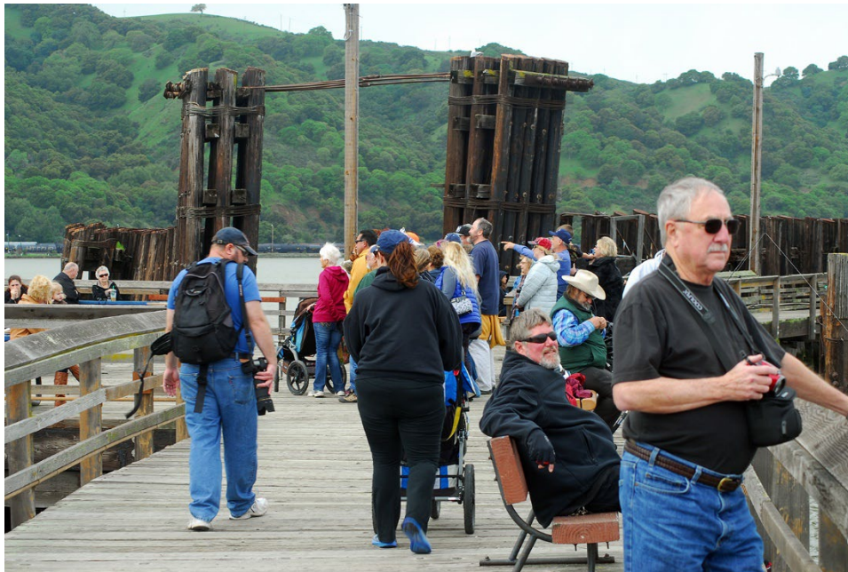
Martinez Marina

California Public Utilities Commission: The California Public Utilities Commission (CPUC) regulates privately-owned electric, telecommunications, natural gas, water and transportation companies.