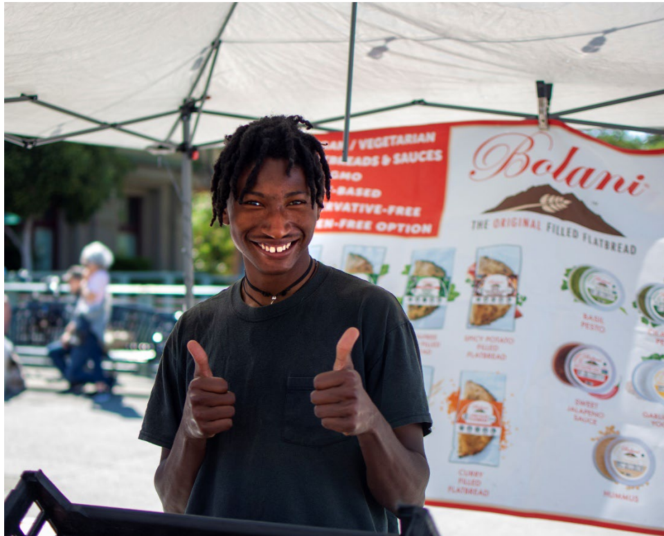
Small Business at Martinez Farmer's Market

Policy LU-P-11.2: Promote City marketing and branding efforts and support similar coordinated private business efforts.