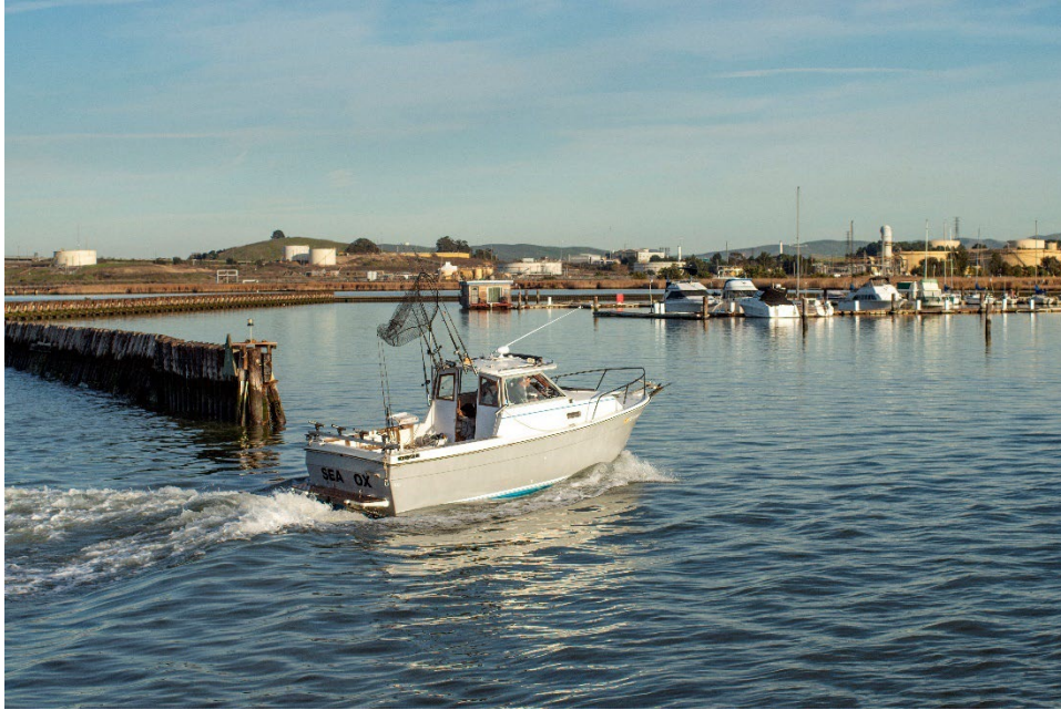
Martinez Marina

described through text and figures, which establish the blueprint for future land uses and demonstrate how these uses are integrated with other General Plan elements and policies.