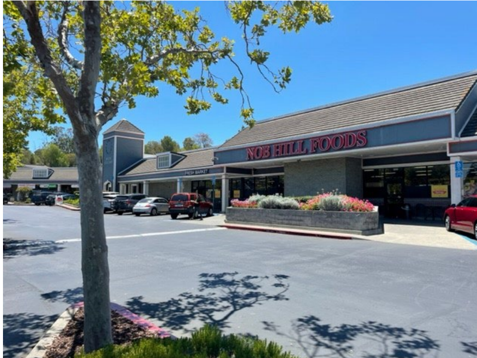
Muir Station Shopping Center

Heavy Industrial Area: The heavy industry descriptor is typified by the petroleum industry. This includes the northeast quarter of the City near Interstate 680 which contains petroleum industry and equivalent uses. Other uses in this area include light industrial uses, landscape contractor yards, and manufacturing companies.