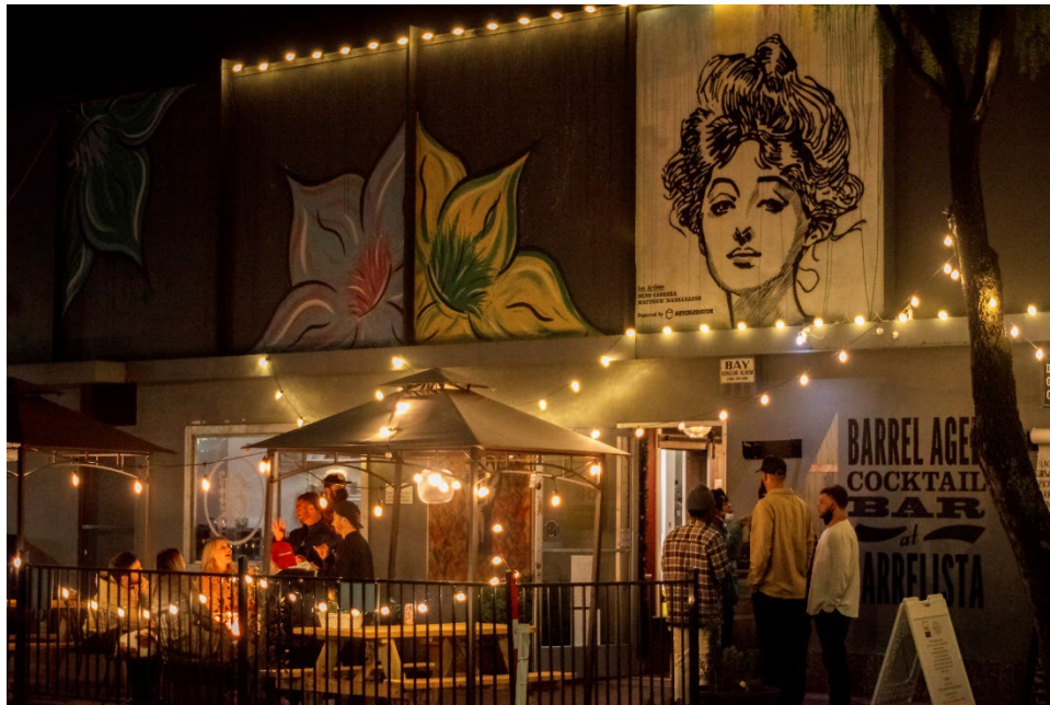
Martinez Nightlife

Policy LU-P-12.6: Develop a plan for pedestrian connections in the Downtown such as plazas and paseos.