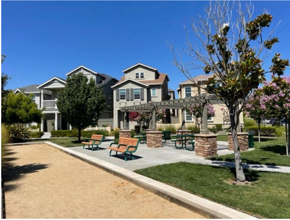
Townhomes on Parkway Drive