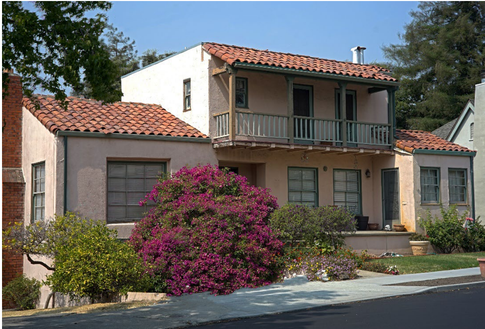
Single-Family Home on Brown Street

John Muir Parkway Specific Area Plan: This specific area plan includes the area north of State Route 4 from the eastern edge of the City at Interstate 680 to approximately Howe Road on west. The area is developed with a mixture of low, medium and high density residential, commercial and open space uses. Land uses are reflected in the new categories of low, medium and high residential, and commercial and regional commercial. Open space areas are designated Open Space (OS).