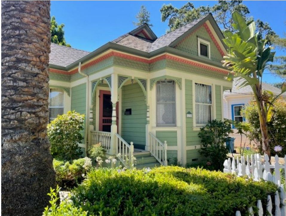
Victorian Home in Central Martinez