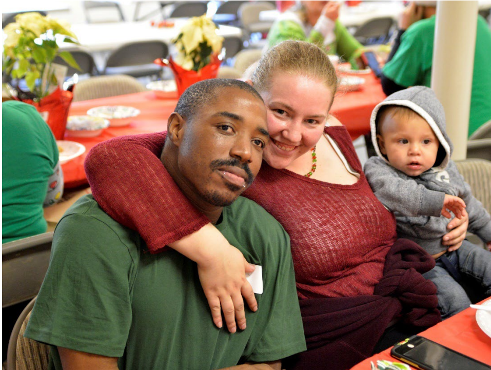
Martinez Residents