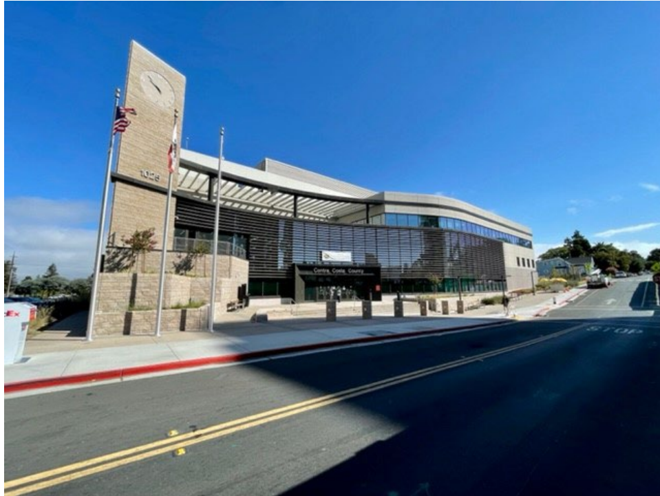
Contra Costa County Administration Building in Downtown

Downtown Shoreline: The portion of the Downtown Shoreline north of the railroad contains two distinct sub-areas: 1) the existing residential Granger’s Wharf neighborhood along Berrellesa Street and 2) the industrial uses along Embarcadero Street. The Granger’s Wharf area retains its historic character from the Italian Fishing Village that existed before commercial fishing was banned along the Carquinez Strait in 1957. The established residential uses and character of Granger’s Wharf should be maintained, although expansion of East Bay Regional Park District’s facilities, as the access into the wetlands portion to the Radke Martinez Regional Shoreline, may be considered. Limited recreation oriented commercial uses may also be possible in the Granger’s Wharf area.