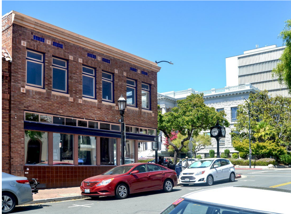
Downtown Martinez