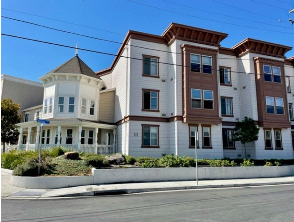
Medium Density Housing west of Downtown Martinez