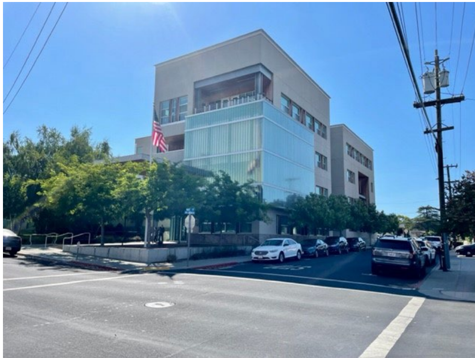
Contra Costa County District Attorney's Office