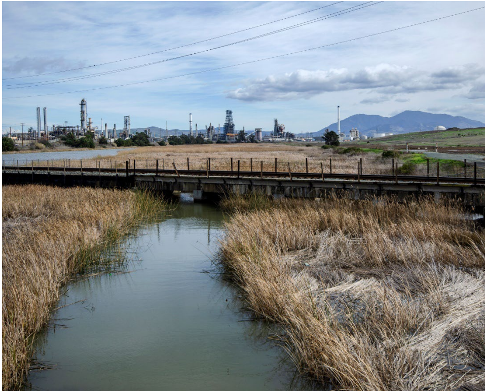
View of Refineries from Martinez Marshlands