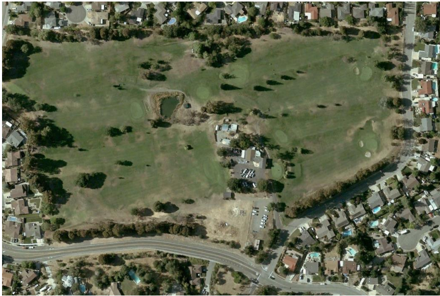
Pine Meadow Golf Course