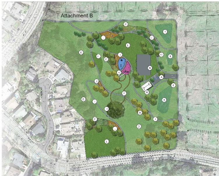
Park Master Plan