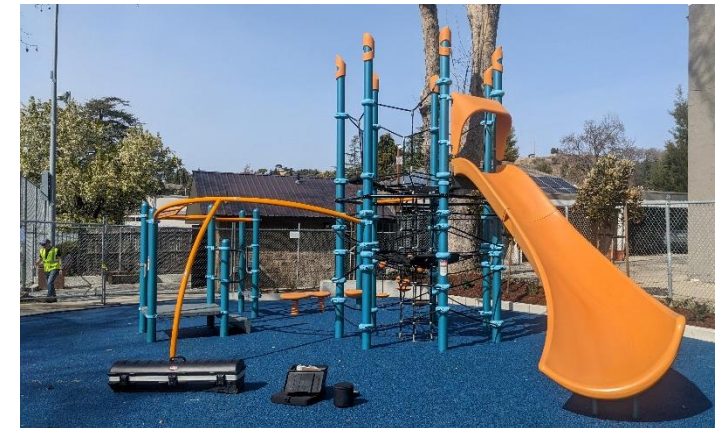
Cappy Ricks Park