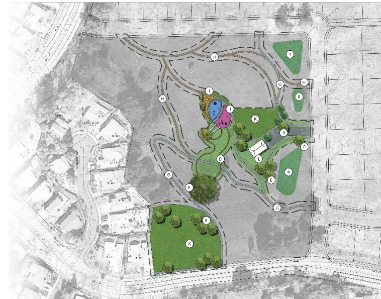
Phase One Project

Design of Phase One park project 65% complete, reviewing layout of restroom building and playground options